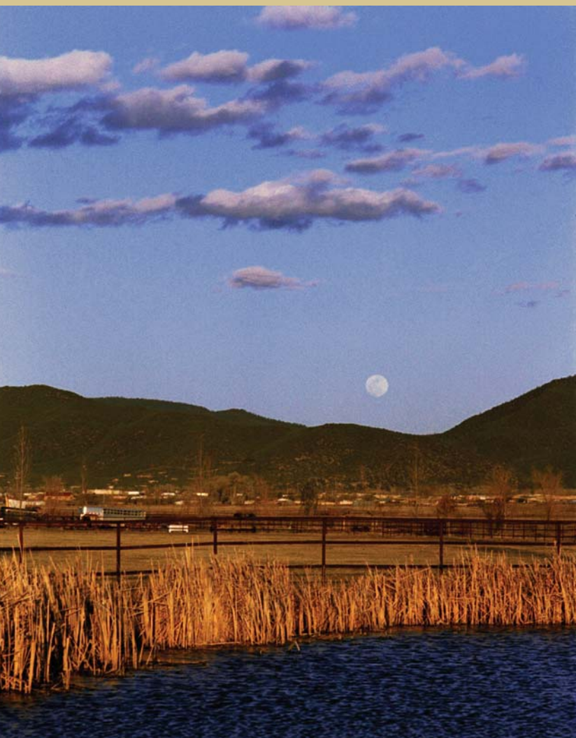
BLACKSTONE RANCH BY WILLIAM DAVIS